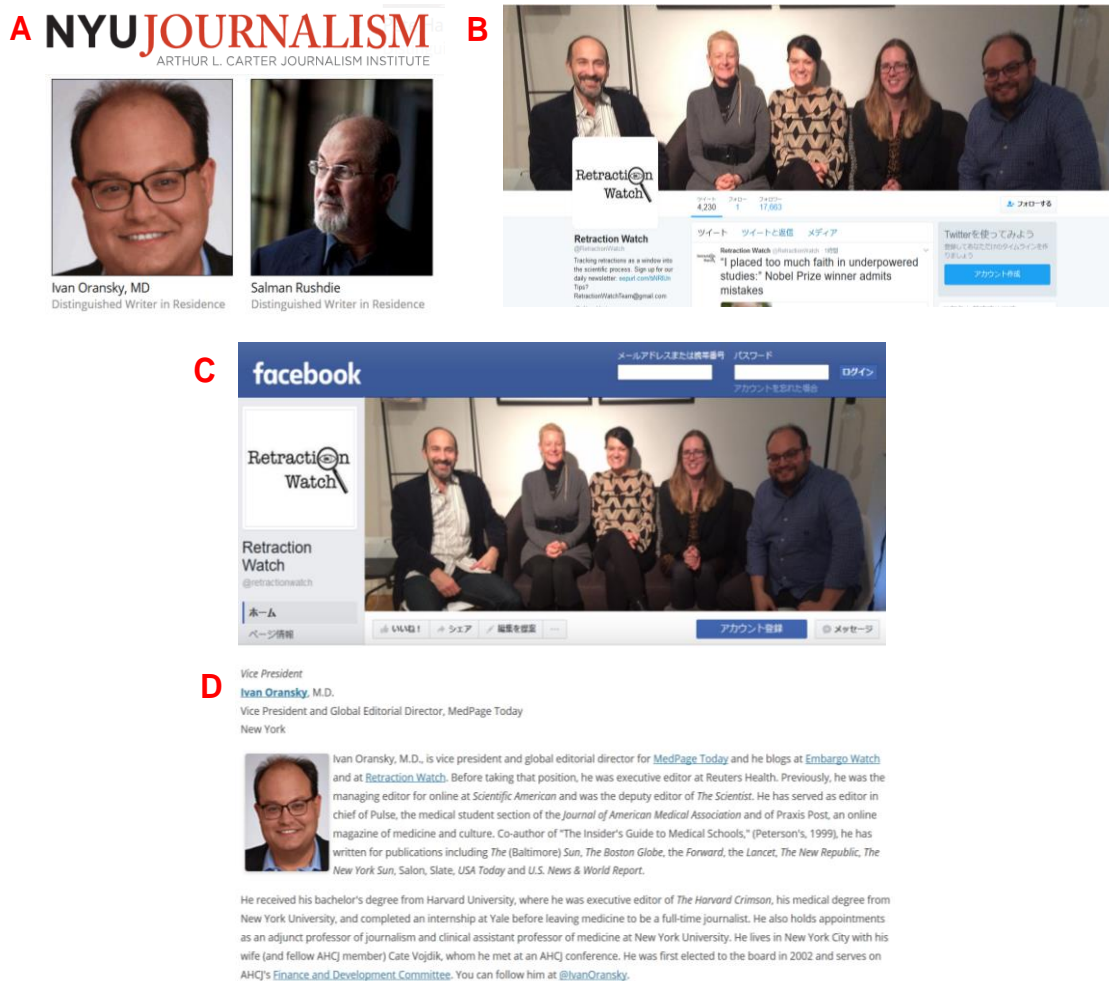
Fig. 1. Screenshot A, B, C, & D

Oransky must be of equivalent exceptional writing or journalistic standards. Retraction Watch imparts news, primarily about science retractions, and is thus an established news organization with a high monthly web-traffic. The media component of Retraction Watch is fortified by its powerful social media presence on Twitter (n.d.) [Fig. 1B], with thousands of followers, and Facebook (n.d.) [Fig. 1C], which are essential components to a media organization, and by the qualifications of its leader, Oransky, who is the vice president of the Association of Health Care Journalists (n.d.) [Fig. 1D]. One can therefore state that Retraction Watch is a formidable web-based media organization, supposedly specializing in science retractions, and that its leadership, primarily Oransky, are exceptionally trained and skilled media professionals.